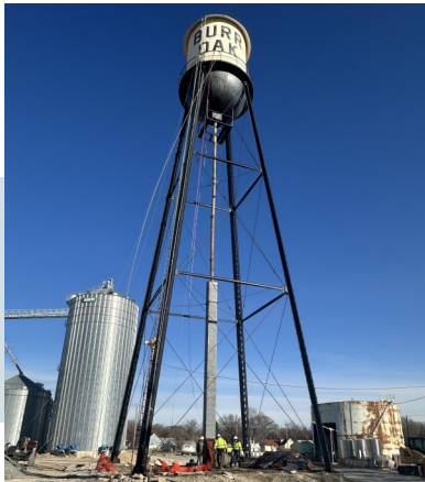
City of Burr Oak water project.

The following pages highlight just some of the NCRPC’s accomplishments in 2024, and we look forward to even greater things in 2025.