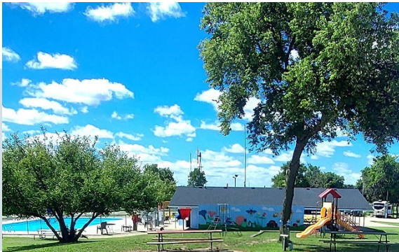
The NCRPC Business Finance Program assisted with a project involving Walt's Four Seasons Campground & Country Store LLC, located east of Abilene, Kansas.