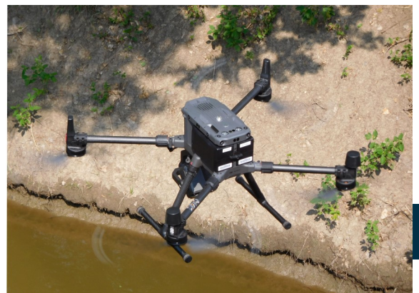
NCRPC continued to administer its Department of Transportation Strengthening Mobility and Revolutionizing Transportation Grant — SMART Counties in Kansas.

including the Kansas Water Office Grant Program and Kansas Department of Transportation’s Transportation Alternatives Program, were utilized. Researching new programs and implementing them in the region is a key focus for the Community Development staff. Once projects are funded, the Community Development staff provide valuable support to local staff to successfully implement their project. Over this past year, the staff has also assisted with four applications to the Economic Development Administration with three slated for approval in the new year. Implementation of three Department of Transportation grants — SMART, Safe Streets for All, and Thriving Communities — have brought opportunities to the region including drone bridge inspection, region-wide safety action planning, technical assistance for the most vulnerable communities in need of upgrades to critical infrastructure and public transportation planning. From beginning to end, well over $35 million will be invested from outside and local sources to make these projects possible. As the planning and development extended staff for our member cities and counties, we act as a key information source knowledgeable about all funding programs. This coupled with our knowledge of the region makes us a unique partner for solving problems and capitalizing on opportunities.