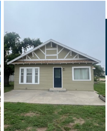
A before and after example of a housing rehabilitation project. Housing projects continued this year in the City of Holyrood and extended into a larger area through the NCRPC Housing Initiative, administered through a partnership with the Dane G. Hansen Foundation.